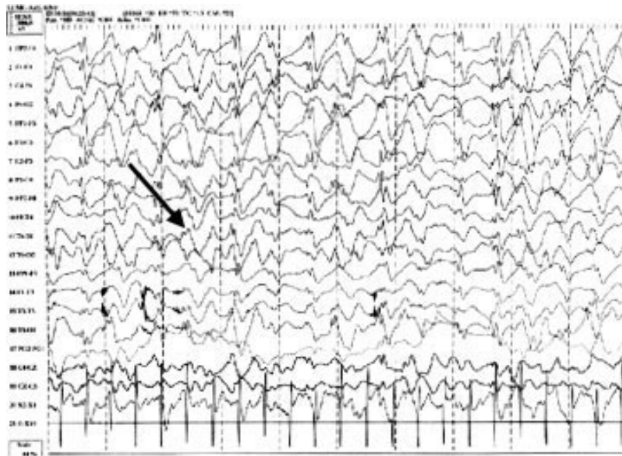
Figure 2 Characteristic Angelman EEG. Triphasic delta wave activity arrowed.

various genetic mechanisms and their frequencies is shown in table 2 and a diagrammatic representation of the 15q11-13 region is shown in fig 4.