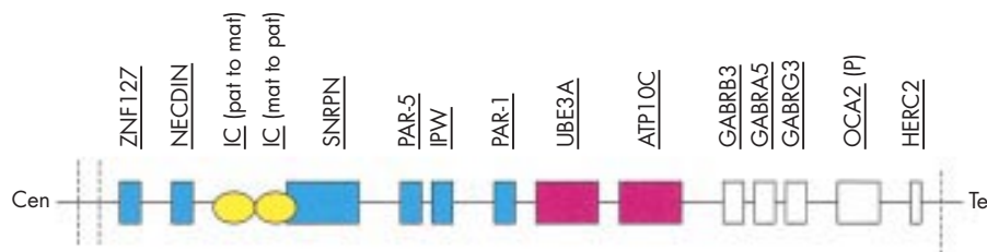
Figure 4 The Angelman/Prader-Willi region on chromosome 15q11-13 which spans 4 Mb. The common breakpoints are represented by dashed lines. Paternally imprinted genes are depicted in blue and maternally imprinted genes in pink. Those depicted in white are not known to be imprinted. The imprinting centre (IC) is bipartite. The centromeric portion is responsible for the paternal to maternal imprint switch and deletions in this part cause AS. For further details see text.